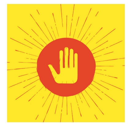
S TOPPED Being restrained, imprisoned, cornered or impeded pursuing one's desires. The accompanying emotion is frustration.