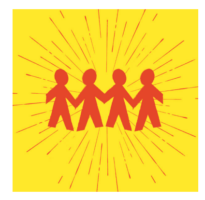
FAMILY Protecting family members against attack or threat.