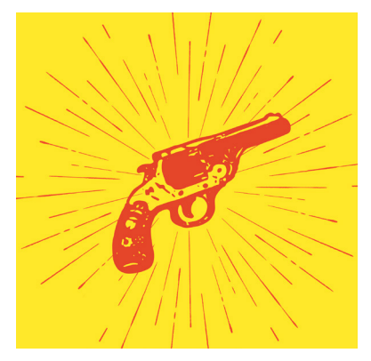
LIFE-OR-LIMB Almost anyone will defend themselves in what is perceived as a life-ordeath attack.