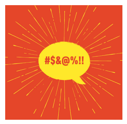
I NSULT Insults will easily provoke rage.