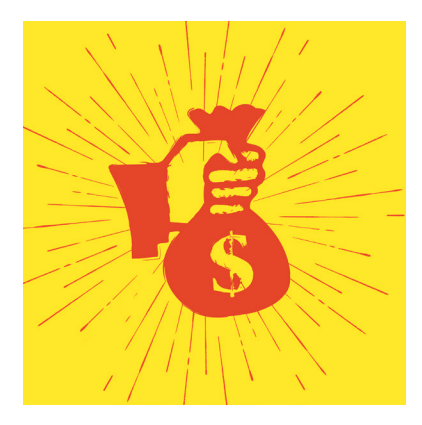
RESOURCES Violence will be used to obtain resources (money, valuable property) and to retain it against theft.