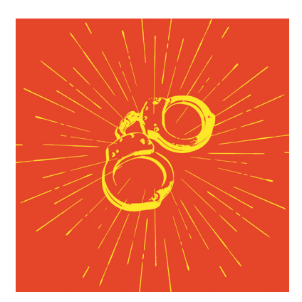
ORDER IN SOCIETY Rage frequently breaks out in response to a perceived social injustice.